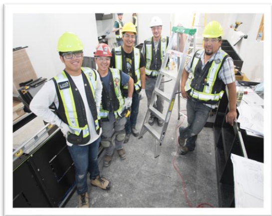
Yellowknife Co-op Pharmacy Tenant Improvements, 2019