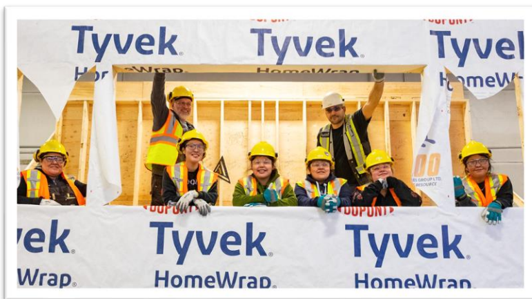
Mine Training Society Women in Trades Program 2021