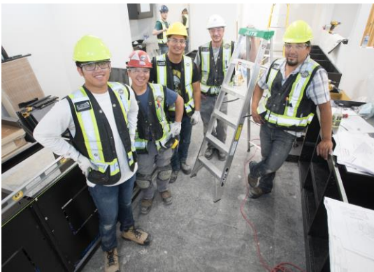
Yellowknife Co-op Pharmacy Tenant Improvements, 2019

Fit Testing safeguards employee lung health by ensuring workers are wearing properly sized and sealed respiratory protective equipment with no leaks and that particulates are being sufficiently filtered. Kasteel has a Certified Fit Tester on staff that can provide testing services at your workplace or at our shop.