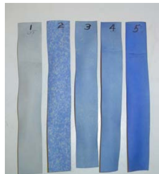
Fig. 4. BPB test results on wallboard paper.

indicate an under-treated sample, whereas a very intense blue may indicate over-treatment. (Fig 4)