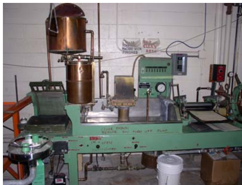
Fig. 1. Handsheet machine.

The zeta potential of the dilute furnish was adjusted to neutral using commercially available polydadmac prior to the formation of a handsheet. Once formed, each handsheet was spray treated with a dilute aqueous solution AEM 5772, which is